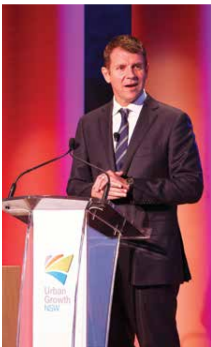
The Hon Mike Baird MP, Premier of NSW

We, as the body of contributors to The Bays Precinct Sydney International Summit 2014, commend the 20 Principles set out in this Statement and applaud the process that generated them.